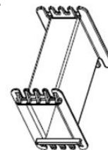
C-25 to C-100 & C-250 Bobbins