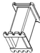
C-4 to C-20 Bobbins